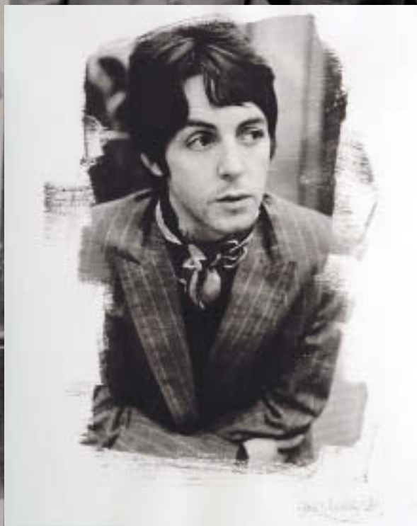
Paul McCartney – a unique photo painting on 20 x 24 inch watercolour paper

Photo paintings are available in two sizes. The smaller size measures 11 x 17 inches and is encased in a perspex frame. The larger size measures 20 x 24 inches and comes in a black wood frame.