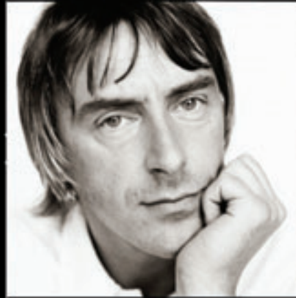
11. Close up