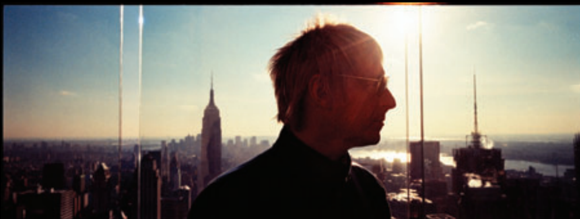
21. New York Trilogy I : The skyline