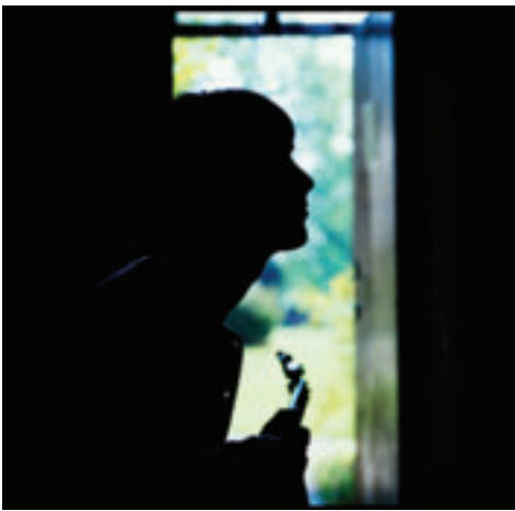
24. Wild Wood