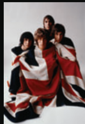
The Who by Art Kane, from our Winter 2007 exhibition