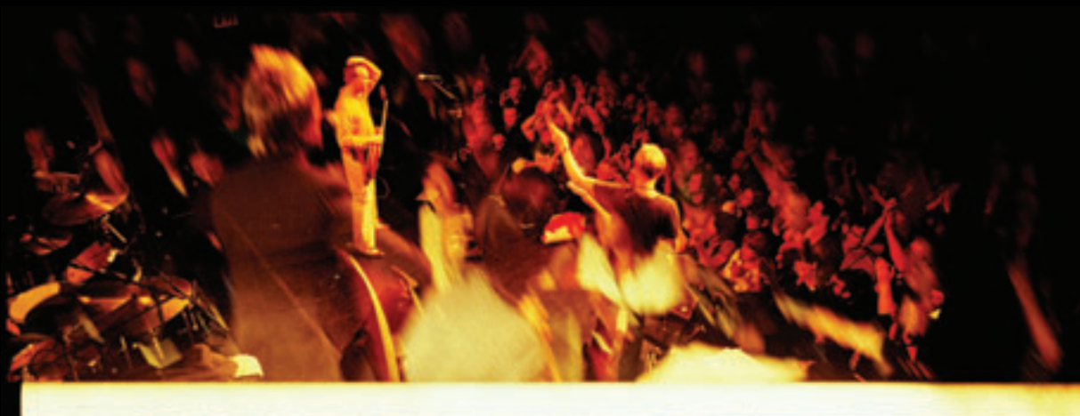
22. New York Trilogy II : The concert