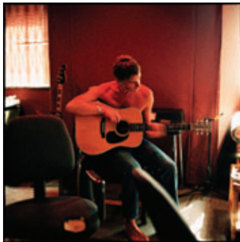
33. Fast Hand