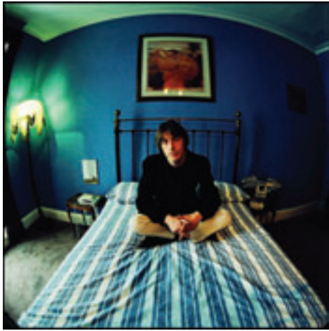
39. Bedroom at Manor Studios