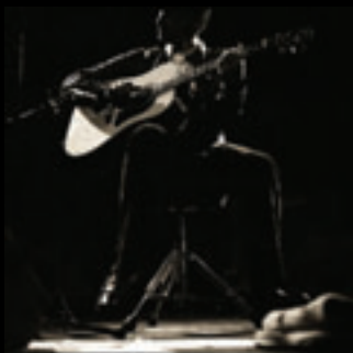
19. Days of Speed