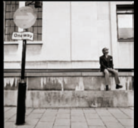
18. One Way