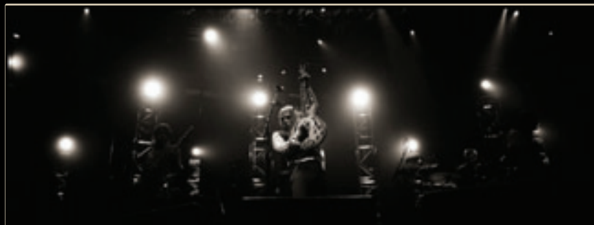
20. In the spotlight