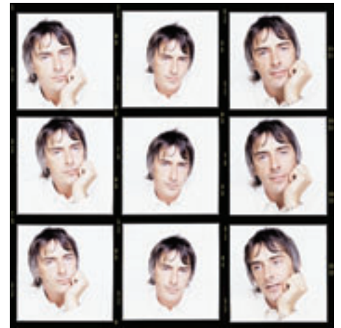
44. Heads Contact Sheet