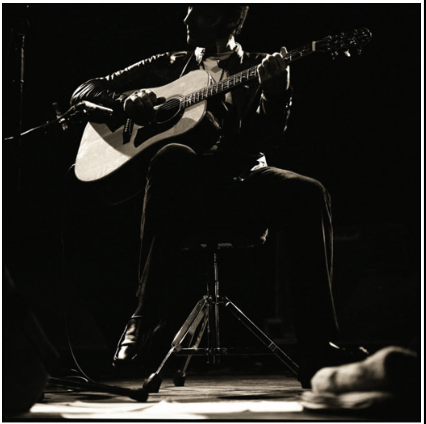
This one was taken on the 2001 Days of Speed Tour. I really like the crop and the lighting on this - it puts the emphasis onto his knees, feet, the stool and his guitar. There's great movement in this picture, and I just love the way his foot is caught mid bounce.