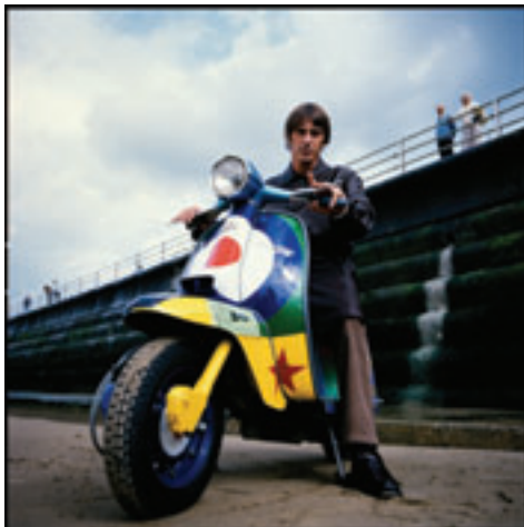
45. Stanley Road Scooter