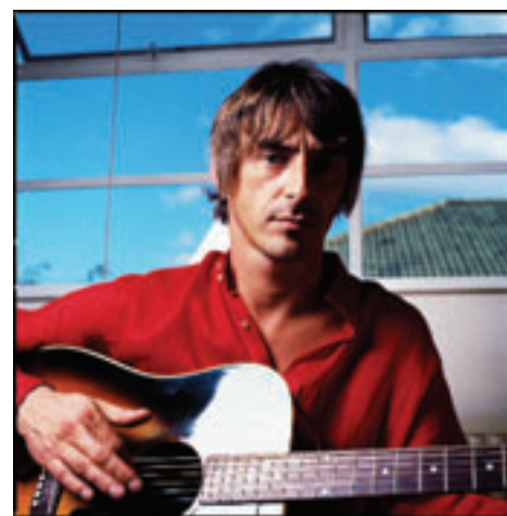
34. Top Of The Pops Dressing Room