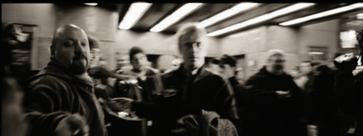
23. New York Trilogy III : Leaving