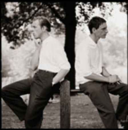
7. Style Council Back to Back