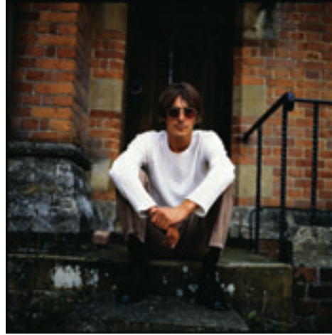
40. Stanley Road