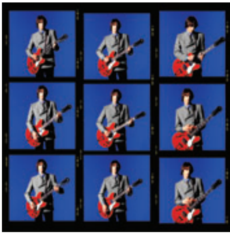
36. Mojo Front Cover