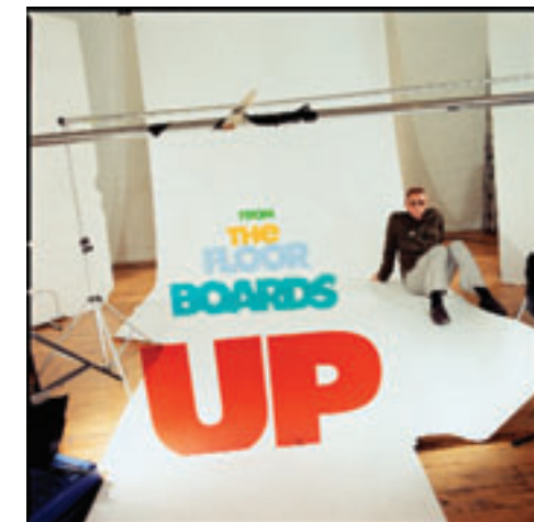
35. From The Floor Boards Up