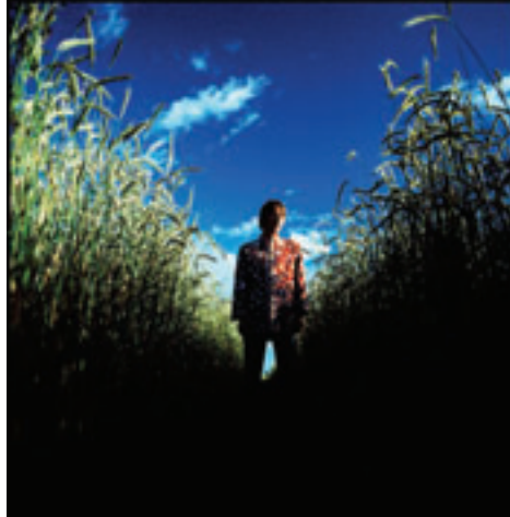
28. Modern Classics