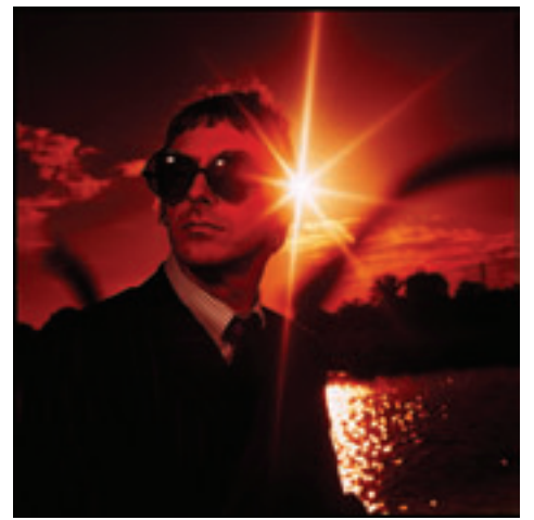
38. Shades of red