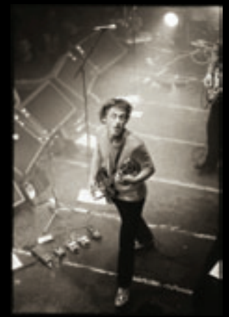
9. Live in Amsterdam