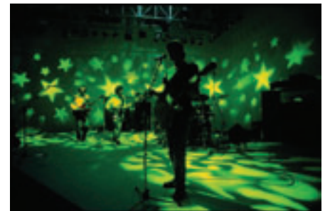
47. It's Written in The Stars