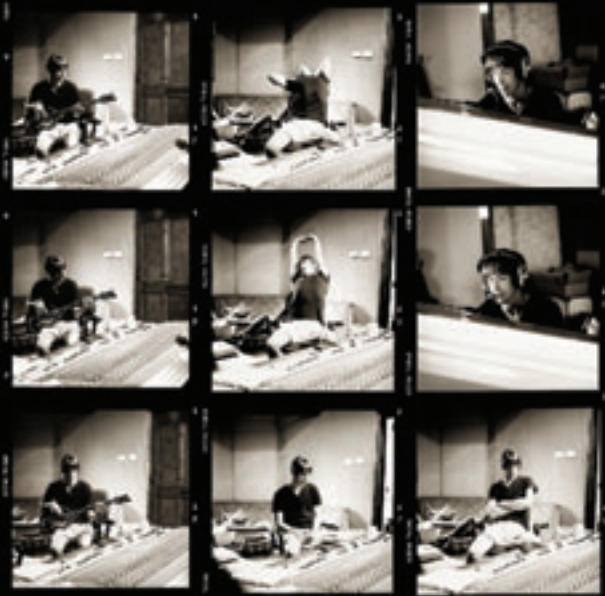
2. Contact sheet : Demos for Wild Wood