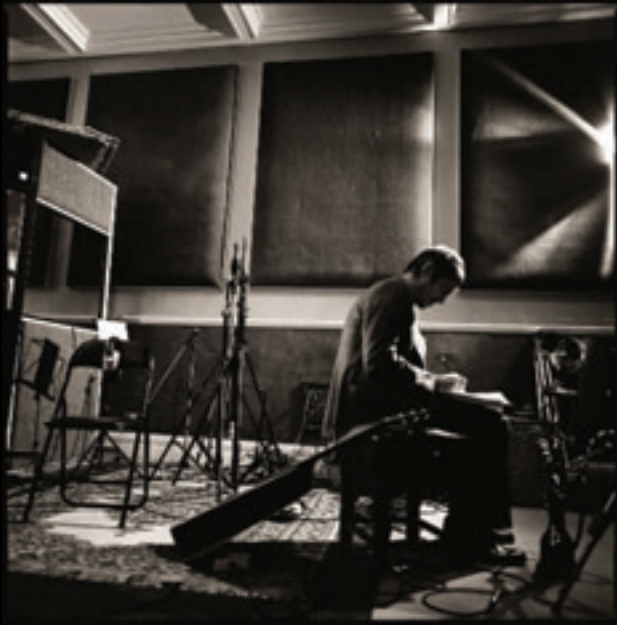
1. Composition for As Is Now Album