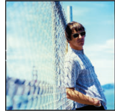
32. San Francisco – Above The Clouds