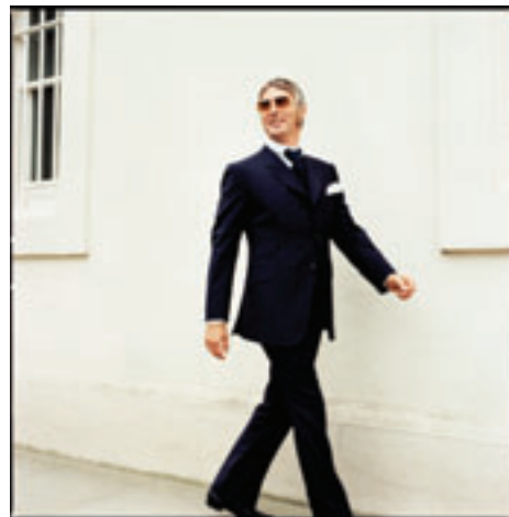
46. The Walk