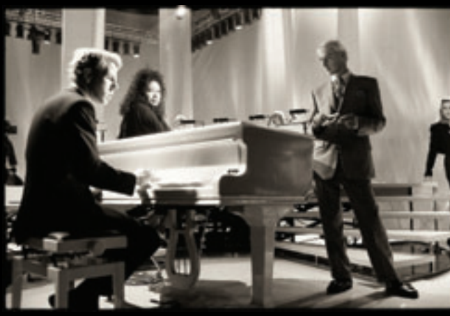
8. Confessions of a Pop Group