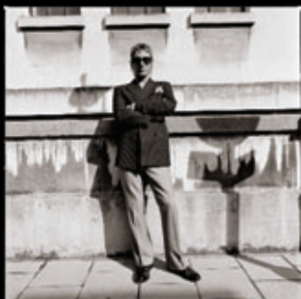
16. As is Now front cover