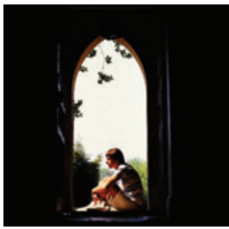
25. Paradise Found