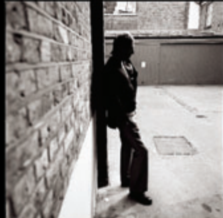
17. As is Now back cover