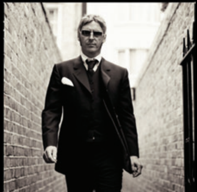
6. Illumination sessions