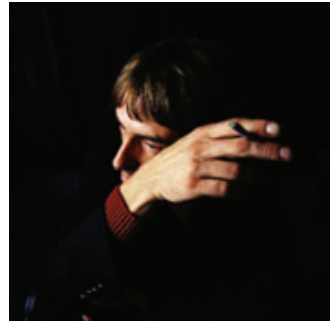
26. The Thinker