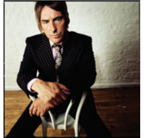
41. The Don