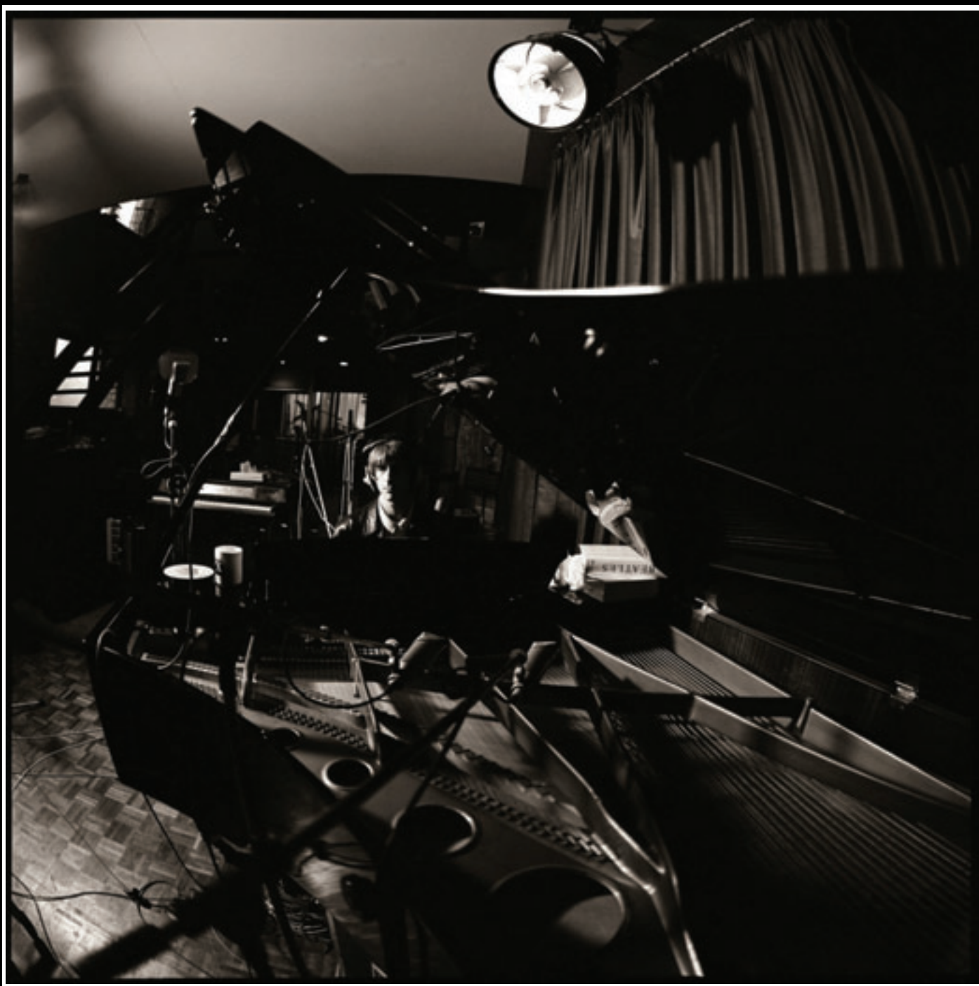
This was taken at the Manor during the recording of Stanley Road. Here Paul seems engulfed by the piano, microphones and other studio equipment framing his face in the photograph. He's oblivious to it all though, totally immersed in the music playing back through his headphones. Note the Beatles songbook close to hand, also reflected in the shiny inner lid of the piano.