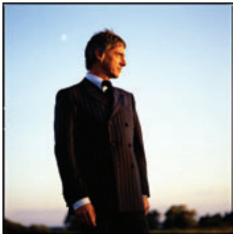
30. Peacock Suit