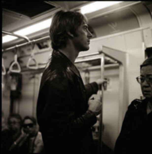
3. Going Underground