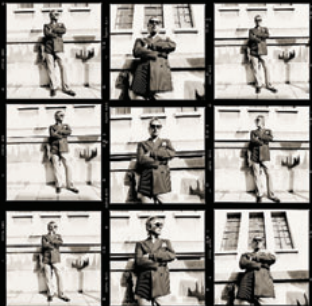
4. As Is Now Contact Sheet