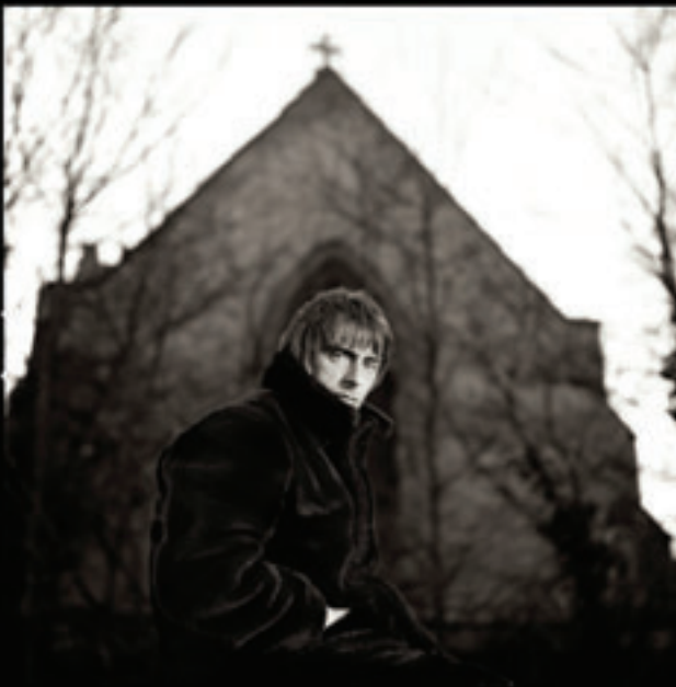
5. Holy Man