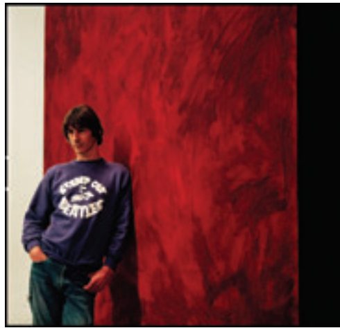
37. Stamp Out The Beatles