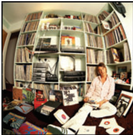
42. The Collector