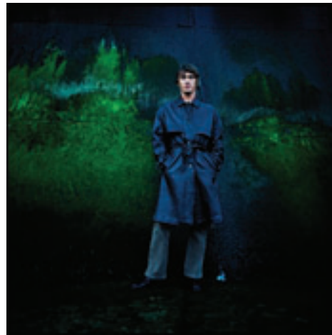
43. Sea Wall, Margate